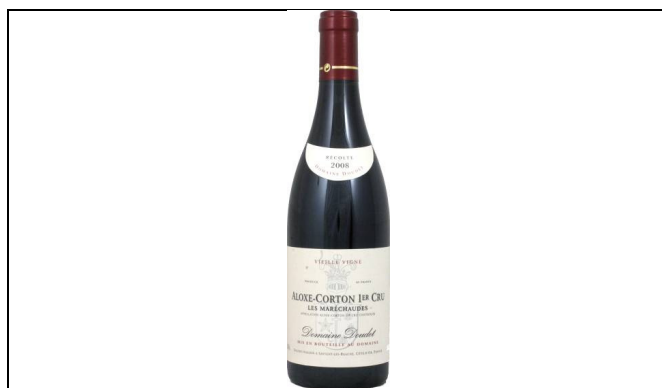
Aloxe-Corton Les Maréchaudes Vieille Vigne, Doudet-Naudin, 2008